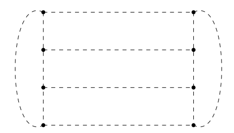
Figure 2: The space of left-orderings of \mathbb{Z}^2 \rtimes_T \mathbb{Z} .

Based on this description, it is not difficult to describe the dynamics of the action of SOL on its space of ordering. We leave this as an exercise to the reader.